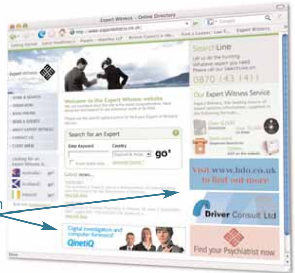
Static Banners on our home page

E-mail campaigns are a popular way of advertising your services to our database. Bespoke advertisements sent to the right people.