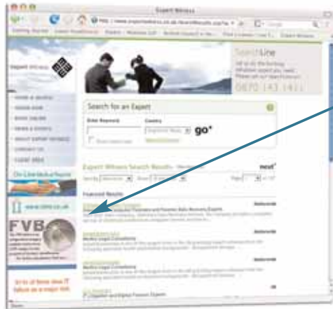
Banners on our search page

All banners have "click links" - that is when your banner is clicked it goes straight to your website. All banners can include animation and revolve images to include all your contact details and relevant points. Our design team are happy to design and advise upon your needs.